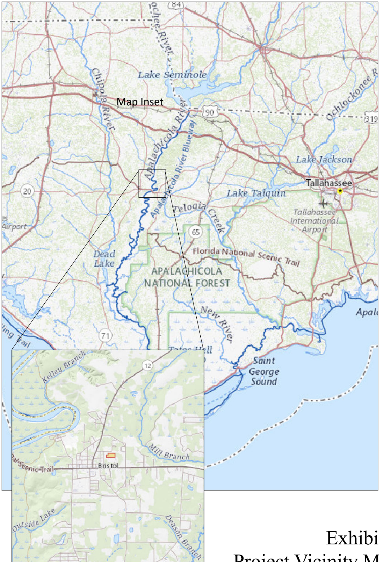
Exhibit 1 Project Vicinity Map